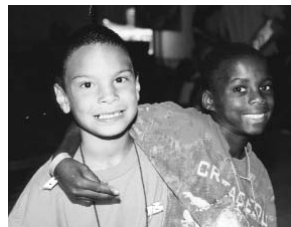
TOP: Open Arms of Minnesota says, "Thanks for the new dishwasher!" CENTER: Loving Food Resources in Asheville, NC, uses its BC/EFA grant to stock their food bank. BOTTOM: Kids enjoy Camp Sunburst, a BC/EFA grant recipient in Rohnert Park, CA.

"My sincere thanks to you and your staff for your continued support of our FoodBasket out here in Hawaii. The demand continues to increase which is a good sign in that people are living longer. We continue to give quality food that people seem to enjoy. We remain small and grassroots in nature but big in heart & commitment."