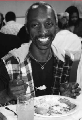
Clients of Food Outreach in St. Louis, MO rely on the balanced meals provided to maintain good health.