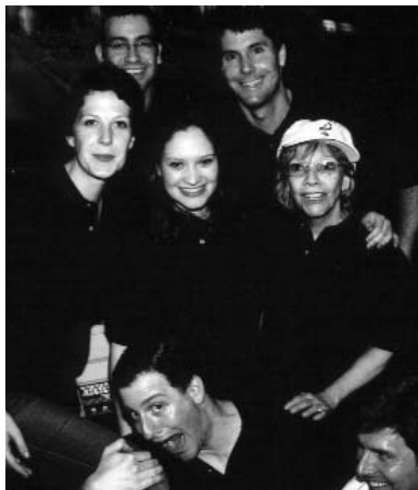
Music, Maestro... please! Eos Orchestra (top), Brooklyn Philharmonic (above), New York Philharmonic (right) and Orchestra of St. Luke's (far right) all tuned up...er, I mean turned up... for our annual benefit bowling bonanza.