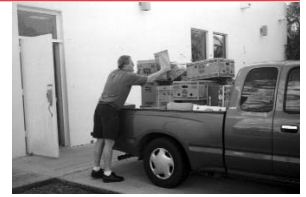
Getting food where it needs to go, Project Response AIDS Center in Fort Pierce, FL, loads their truck for delivery.

To learn more about the service programs of The Actors' Fund of America, please visit www.actorsfund.org .